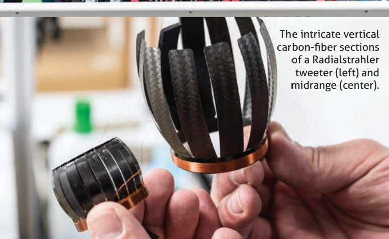
The intricate vertical carbon-fiber sections of a Radialstrahler tweeter (left) and midrange (center).

Throughout the factory bilingual signs (in German and English) identify various functional areas—the Polishing Room and Foiling Room, for instances. There's also an 8000-square-foot warehouse where some 4000 SKUs of parts, including machined materials in different stages, are stored. Even the shipping area is carefully considered under Christian's thoughtful leadership: All of the packaging materials are made locally, and the shipping crates are assembled by disabled workers. Even the loading dock was remarkably spick-and-span, and Otis Redding's “Sittin' on the Dock of the Bay” was playing as we entered, giving the space a good vibe. t3s