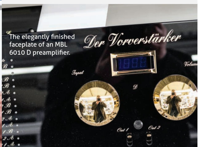
The elegantly finished faceplate of an MBL 6010 D preamplifier.