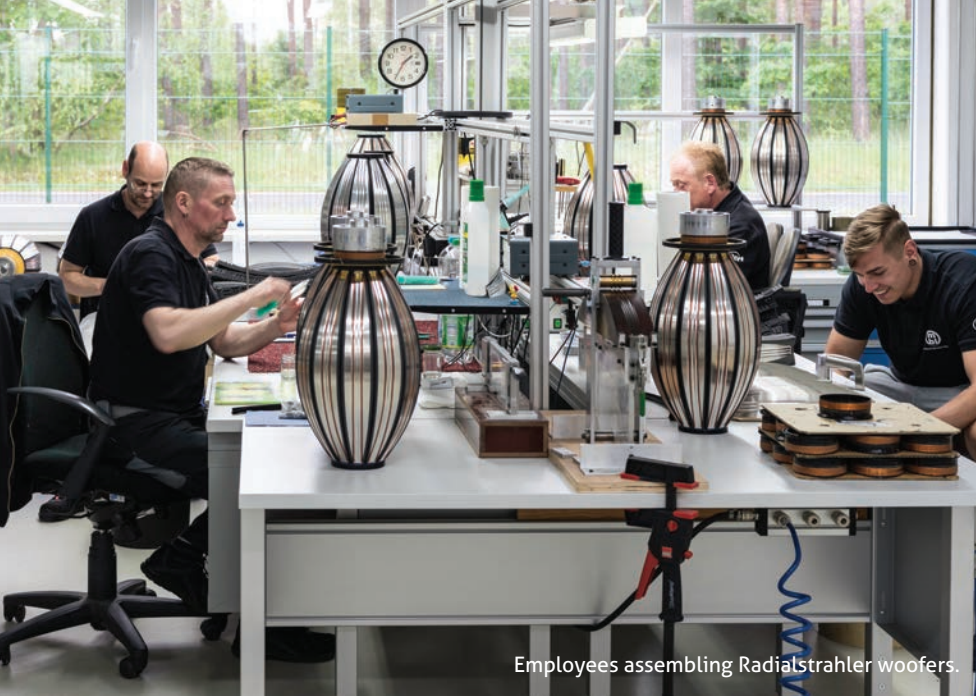
Employees assembling Radialstrahler woofers.

central area for administrative offices, the facility has a “clean side” and a “dirty side”—the former consists of roughly 8000 square feet where assembly, testing, and finishing take place; the latter is the factory floor area where CNC machines mill parts—often to tolerances of 1/100 th of a millimeter—and workers perform early-stage refinements, such as smoothing aluminum feet,