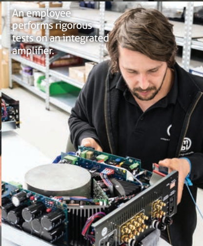
An employee performs rigorous tests on an integrated amplifier.

copper binding posts, and brass control knobs by hand using a sharp tool that resembles a dental instrument. MBL's unique driver designs also require painstakingly precise assembly by skilled hands. On the woofer “melons,” whose omnidirectional radiating surface area serves as the equivalent of a 21-inch woofer, the lengths of copper that provide structure and rigidity must be glued by hand to avoid air bubbles. Each tweeter is made of 24 little segments of carbon fiber with tiny voice coil wire wound around them at the base. If anything is found to be less than perfect on a part or product, the process starts over from scratch. It probably goes without saying but all areas of the factory are extremely well organized and thought through. As with anything hand-built and held to such high production standards, it's quality over quantity. You can't rush perfection.