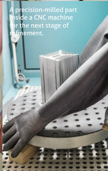
A precision-milled part inside a CNC machine for the next stage of refinement.