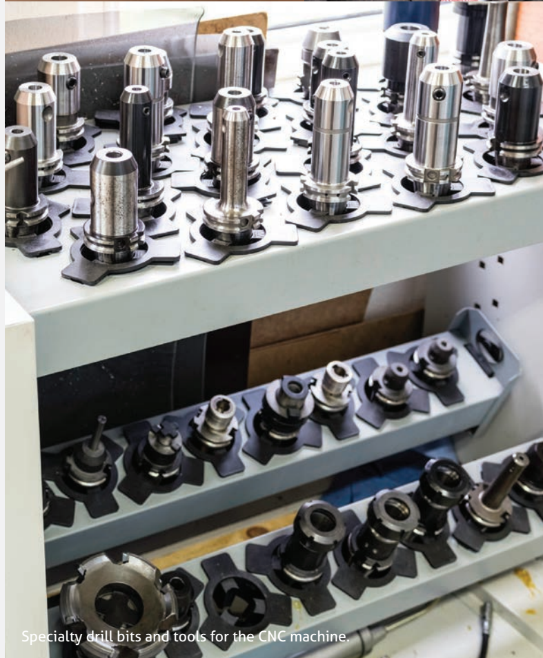
Specialty drill bits and tools for the CNC machine.