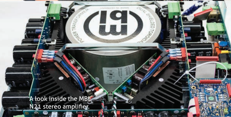
A look inside the MBL N21 stereo amplifier.

copper binding posts, and brass control knobs by hand using a sharp tool that resembles a dental instrument. MBL's unique driver designs also require painstakingly precise assembly by skilled hands. On the woofer “melons,” whose omnidirectional radiating surface area serves as the equivalent of a 21-inch woofer, the lengths of copper that provide structure and rigidity must be glued by hand to avoid air bubbles. Each tweeter is made of 24 little segments of carbon fiber with tiny voice coil wire wound around them at the base. If anything is found to be less than perfect on a part or product, the process starts over from scratch. It probably goes without saying but all areas of the factory are extremely well organized and thought through. As with anything hand-built and held to such high production standards, it's quality over quantity. You can't rush perfection.