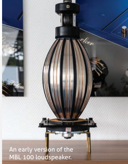
An early version of the MBL 100 loudspeaker.