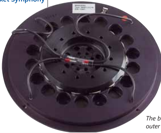
The back panel of the MSW is connected to the outer world via numerous openings.

This goes for the bass range, too. Sufficiently low, but very dry and tight. And the subtleties are a revelation: In its closed cabinet the woofer clearly depicts the tonal differences of various drums and recordings without limiting its dynamics which are excellent, anyway. The MSMs1 handles high volume levels very well and seems