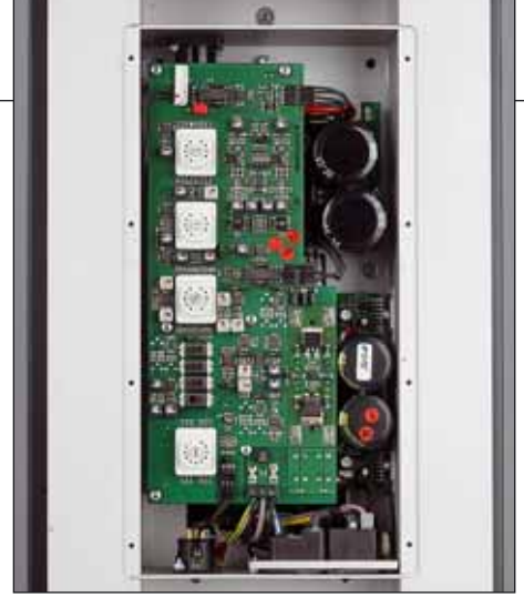
As far as sound, dynamics and operational safety is concerned the electronics unit of the MSMs1 is beyond all doubt.

Except for the switching and volume control of the sound sources no further amplification electronics are needed. Balanced outputs should be available, though. And then the choice is yours: The studio technology can be configured in many ways. Treble adjustment, equalization at 3 kHz in silk screen mode, bass correction, high pass filter for AV applications, polarity, input sensitivity – you name it! We recommend to leave everything in center position in the beginning. With this setup the MSMs1 already sounds brilliant and the desire for changes will evaporate into thin air immediately. Right from the start the loudspeaker offers incredibly natural voices and instruments, completely smooth and realistic. A piano sparkles with perfect timing, a guitar vividly scampers through the room, strings gently float around your head and a percussion section cracks and bangs inimitably. Each voice is a gem that glows